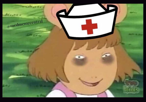
What my family thinks I do