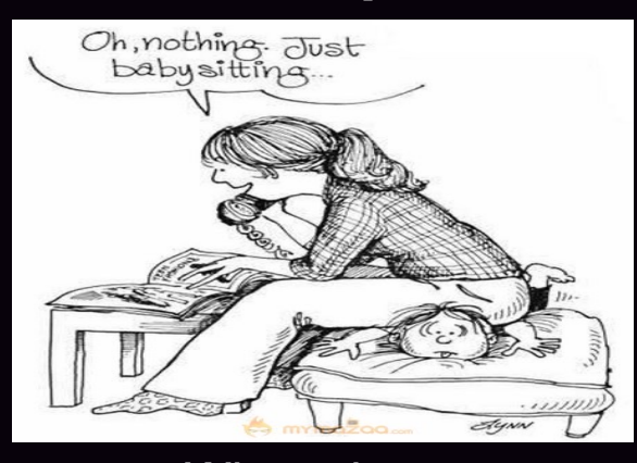
What other departments think I do