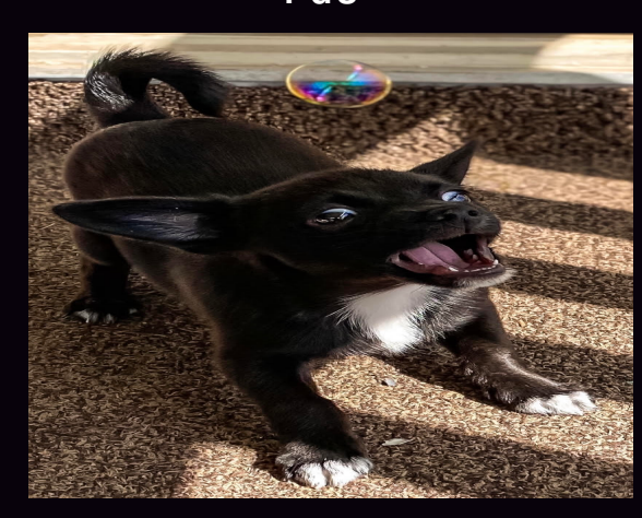
Who I do it for